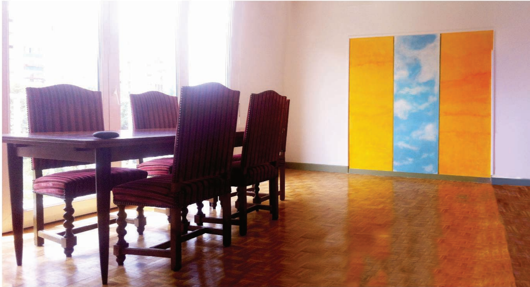
The common space: the living/dining room

The living room is large enough to accommodate two sofas, a coffee table and a TV as well as a dining table that can host up to six people. In some of the apartments, a third bedroom was created with a separation wall, which was painted with patina to decorate the living room. The same pattern was used to bring warmth to the room in all of the apartments.